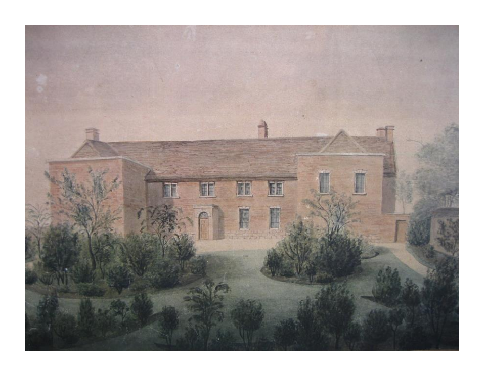
The Rectory from the front (north elevation) c 1750

The shaped trees on the left flanked the door through the wall to the Churchyard; they or their descendants are still there in the garden of one of the houses of the present Rectory Close, built on the site in the 1960s. Part of one can also be seen in the earlier painting