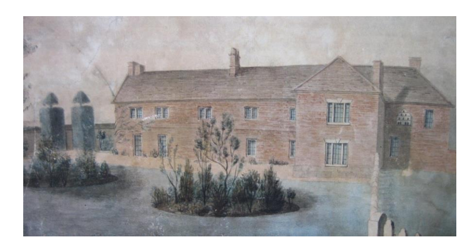
Barby Rectory south elevation c 1750

The shaped trees on the left flanked the door through the wall to the Churchyard; they or their descendants are still there in the garden of one of the houses of the present Rectory Close, built on the site in the 1960s. Part of one can also be seen in the earlier painting