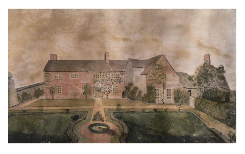
The old Rectory from the south c 1700

The earlier painting (below) shows the south front before a new wing was built in place of the rather ramshackle affair depicted. Its colouring suggests it could have been of brick (a high class building material at this period), but it may have been of red sandstone like the church tower. The building on the right is certainly painted with a definite suggestion of stone on the gable end.